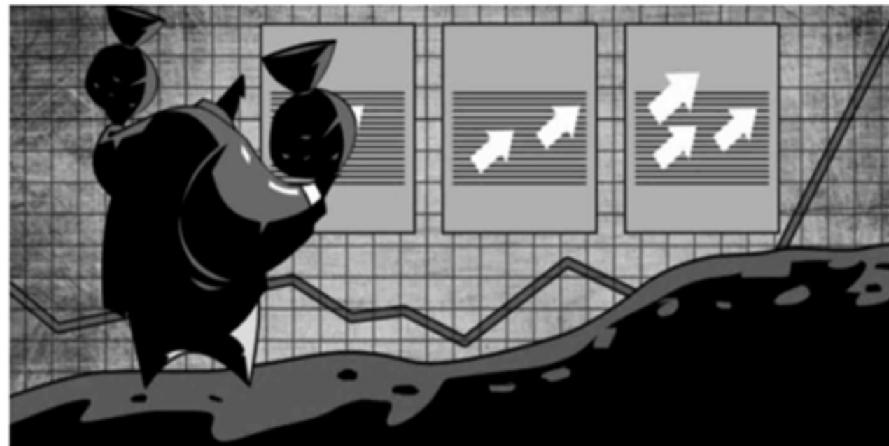
ILLUSTRATION: BINAY SINHA

The long-term fiscal policy road map for the Centre and states will be laid down by the 15th Finance Commission. The longer-term fiscal